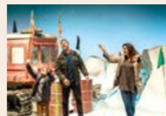
1 The Storm Room

How does penguin conservation ensure the future of the species? Why is this important to the wider ecosystem?